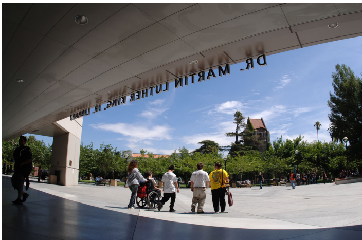
Students leaving MLK Library

Our library has an immense amount of resources and study space, it is just unfortunate it isn't open all the time.