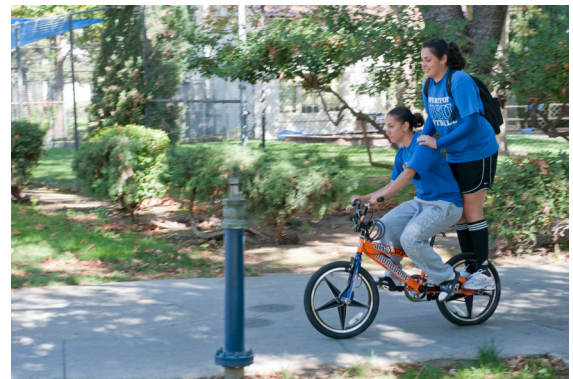
Bikepooling in action

One thing I really like about SJSU is that it is rather accommodating to riders. I